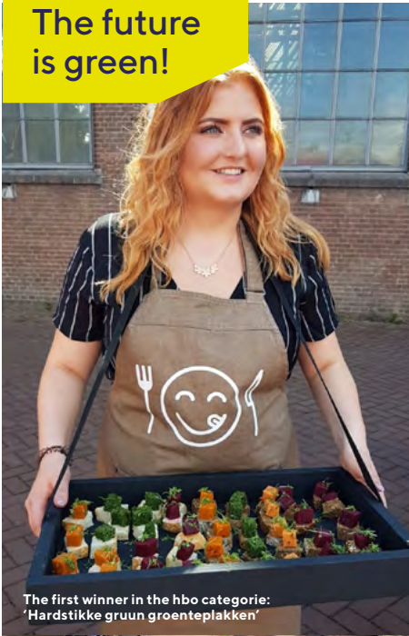
The first winner in the hbo categorie: 'Hardstikke gruun groenteplakken'